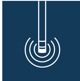
Probes + Electronics